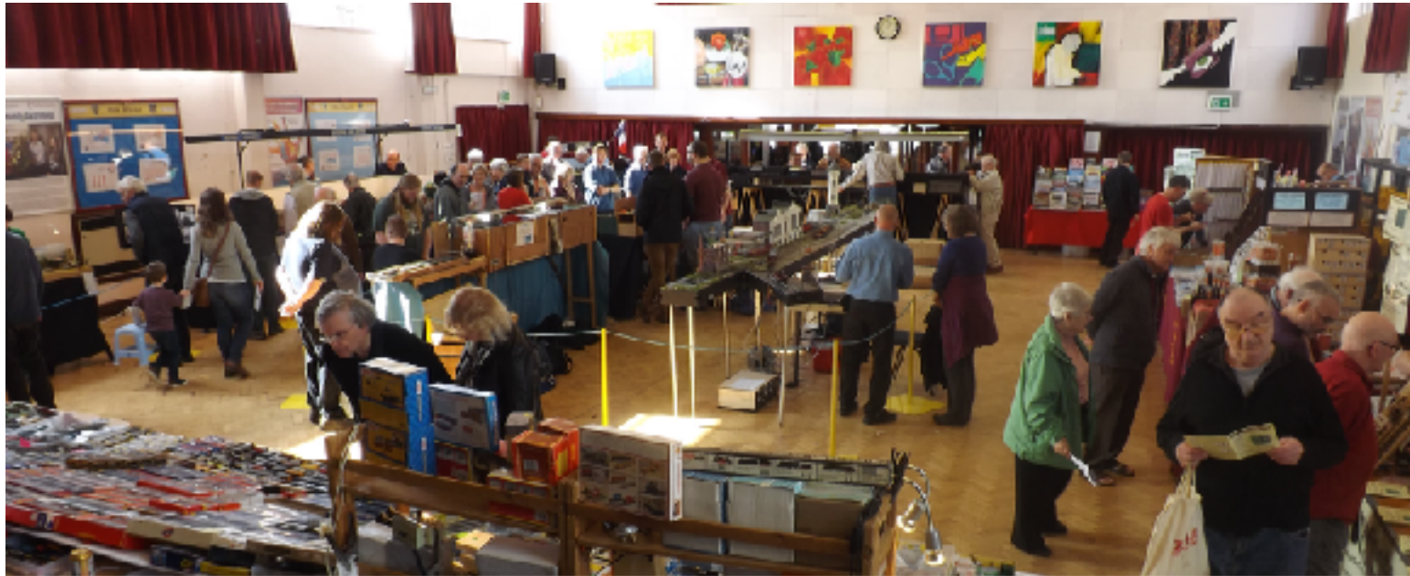
Quiet? Of course it's quiet. It's lunch time on Sunday. Catering, on the other hand, was packed! The roast chicken Sunday lunch was definitely not to be missed!

impressive, quality was of the highest standard, too. Not surprisingly, catering did a 'roaring trade'!