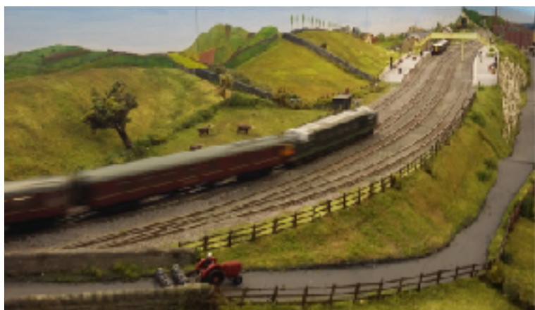
Sutton Hill - MMRG's '00' layout .....before dismantling!!

And speaking of free pints, there were more than a few collected by volunteers (sadly, only one each!) who had helped set up the show on Friday evening! A very small but well earned thank you to all those who so willingly gave up their time. It would seem that we broke all records in the time taken to both set up the exhibition on Friday and pack it all away on Sunday. A huge thank you to all involved. Without your help, the exhibition would have been hard work to say the least! From a personal point of view, I was amazed to find that I had left the exhibition when almost everything had been 'dismantled' (just one trade stand remaining) and packed away,