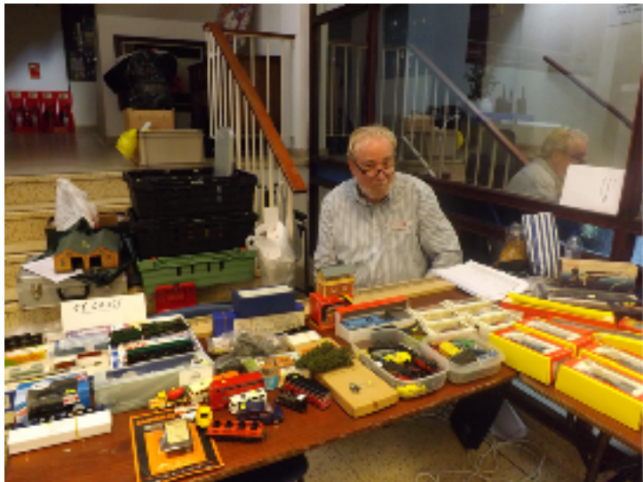
Yours truly trying to look serious with a mouthful of cinder toffee!

Putting the Members' Stall next to 'Sweets of Yesteryear' was not the best of planning! That chocolate coated cinder toffee was to die for and as for trying to speak whilst eating it ..... impossible! It's a good job that what we had on