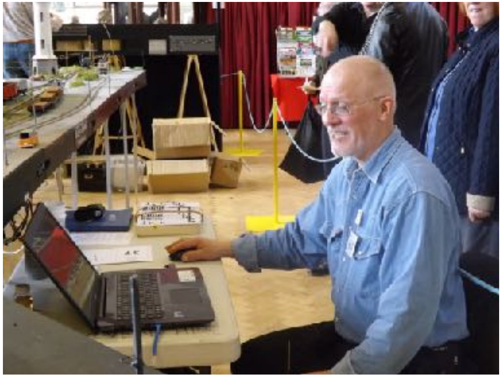
Doesn't he just love 'playing trains'!

Compared to many other shows I have attended during the last 25 years, this one in Macclesfield was well organized. The catering was very good and varied and the food was excellent. I have never had such good meals at model railway shows.